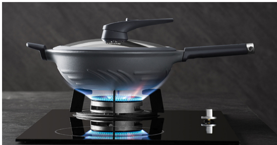
The Laminar Pressure Series